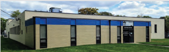
200 Pond Avenue | Middlesex, NJ 08846