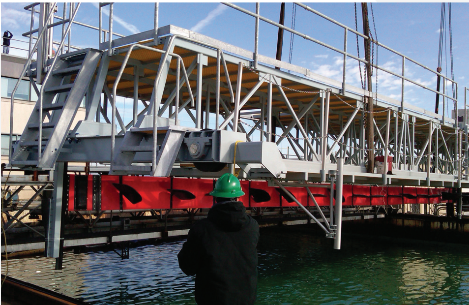
Large environmental lab test platform

Sigma Design Company's experience shows that a multi-stage approach is the most efficient way to ensure you get the best product at the best manufactured cost. Each stage has a deliverable, which gives you better control of the project.